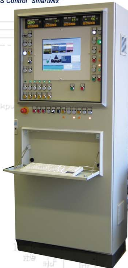
PCS Control "SmartMix"